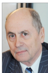
Dr. Ján Čarnogurský Former Prime Minister of Slovakia (SK)

Born in Siberian exile where her family was deported after the Soviet occupation of Latvia. At the end of the 1980s, she entered politics and promoted the independence of Latvia from the Soviet Union. Former Minister of Foreign Affairs of Latvia and Latvian EU Commissioner. Author of most-translated book in recent Latvian history, an autobiography "With dance shoes in Siberian snows". She is the chair of the Reconciliation of European Histories Group in the European Parliament.