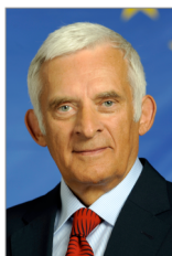
Prof. Jerzy Buzek MEP, Former President of the European Parliament (PL)

In the 1980s, Mr Buzek was involved in anti-Communist movements, including the trade union movement Solidarity. He has been a member of the European Parliament since 2004. President of the European Parliament from 2009 to 2012. In 1997-2001, he was Prime Minister of Poland, guiding Poland into NATO in 1999 and initiating the country's accession negotiations to the European Union in 1997.